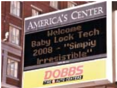
The America's Center marquis announces Baby Lock Tech 2008.