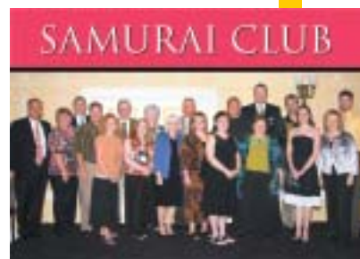
Samurai Club: Top Serger Sales for 2007.