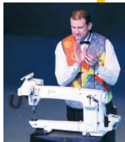
New Baby Lock Jewel.